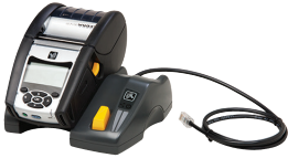
Single-bay QLn Ethernet Cradle